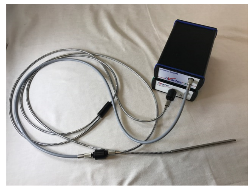
Figure 4. Typical set-up fluorescence probe configuration.

To mitigate the collection issues associated with this Fluorescence system configuration, it becomes necessary to add additional filtration steps along the collection path. Avantes offers both inline and direct attached filter holders which allow the user to filter the signal on both the excitation and collection paths. Typically, placing a bandpass filter in the excitation line, and only allowing light in the excitation band into the probe will accomplish this. Since there is no such thing as a perfect filter, however, it is often necessary to add a long pass filter on the collection path to further reduce the excess light from the excitation source. Figure 4 shows an example set-up where the FH-DA direct attach filter holder is attached to the excitation light source, and an FH-INL inline filter holder is inserted between the collection leg of the bifurcated fiber and a patch cord connected to the spectrometer.