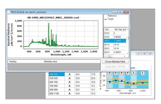
A spectral match screen in DARWin SP on the SR-1901PT showing a spectral match for a Class A solar simulator.