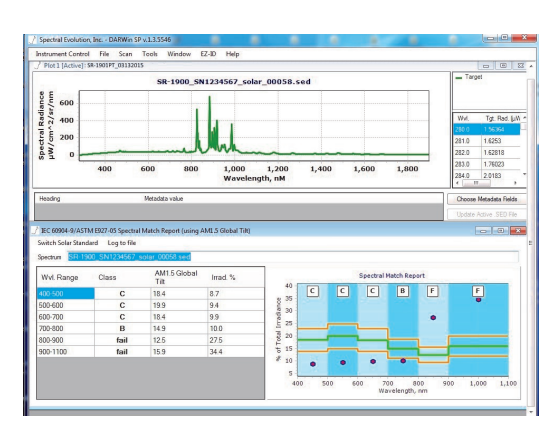
A spectral match report from the SR-1901PT showing the classification of a low cost solar simulator.

26 Parkridge Road ♦ Suite 104 Haverhill, MA 01835 USA