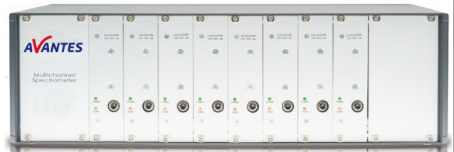
Avantes 10 channel rackmount spectrometer

Avantes unique multichannel fiber optic spectrometers provide an excellent alternative to more expensive traditional optical emission spectroscopy technologies. Avantes instruments can easily be configured in an array such that each instrument "channel" covers a short wavelength range with very high resolution. The array of instruments may cover 190-2500 nm with each spectrometer covering a 200-300 nm bandpass. Typical configurations offer resolution as low as 0.08 nm (FWHM) in the UV and all the instruments are converged together using fiber optic cables which terminate in a common connector which is positioned at the wall of the vacuum chamber. Fiber optic vacuum feed throughs may also be used to measure closer to the plasma within the chamber. The entire system is irradiance (intensity) calibrated against a NIST traceable source so as to facilitate comparability of data from one instrument to the next and enable variable integration times across the channels for optimal dynamic range. For more information about plasma measurements and optical emission spectroscopy contact an Avantes Sales Engineer at infousa@avantes.com in the Americas.